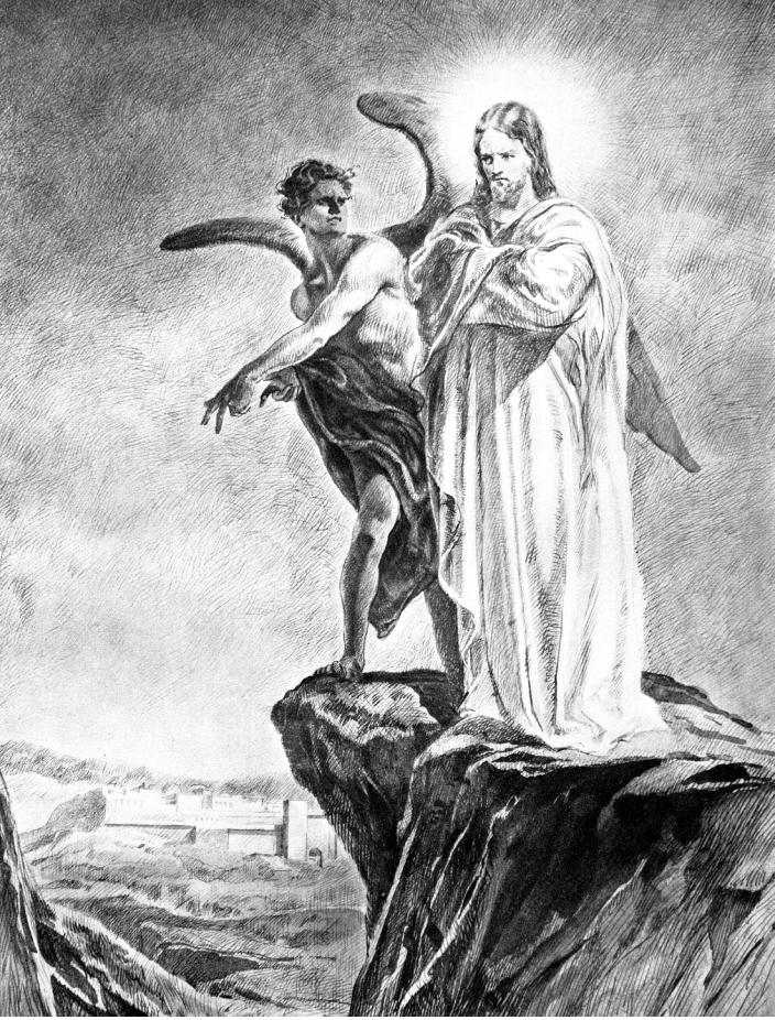
Jesus fasted for forty days and forty nights and was tempted.

Mailing Address (both parishes): 7732 E State Rd 4 Walkerton, IN 46574