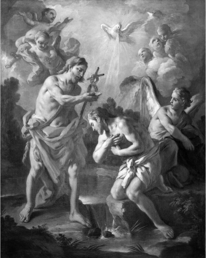
"This is my beloved Son, with whom I am well pleased."

Mailing Address (both parishes): 7732 E State Rd 4 Walkerton, IN 46574