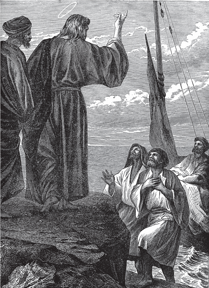
Jesus calls Peter and Andrew to follow him and become fishers of men.

Mailing Address (both parishes): 7732 E State Rd 4 Walkerton, IN 46574