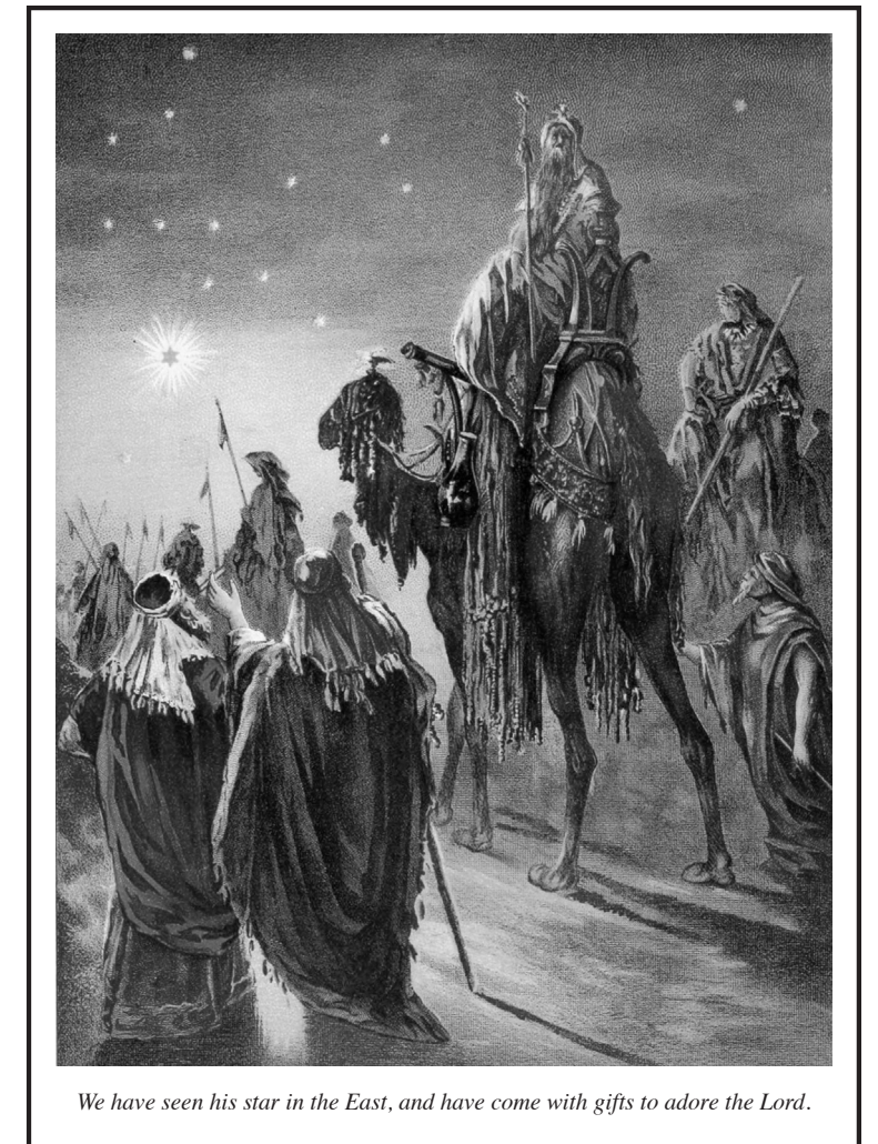
We have seen his star in the East, and have come with gifts to adore the Lord.

Mailing Address (both parishes): 7732 E State Rd 4 Walkerton, IN 46574