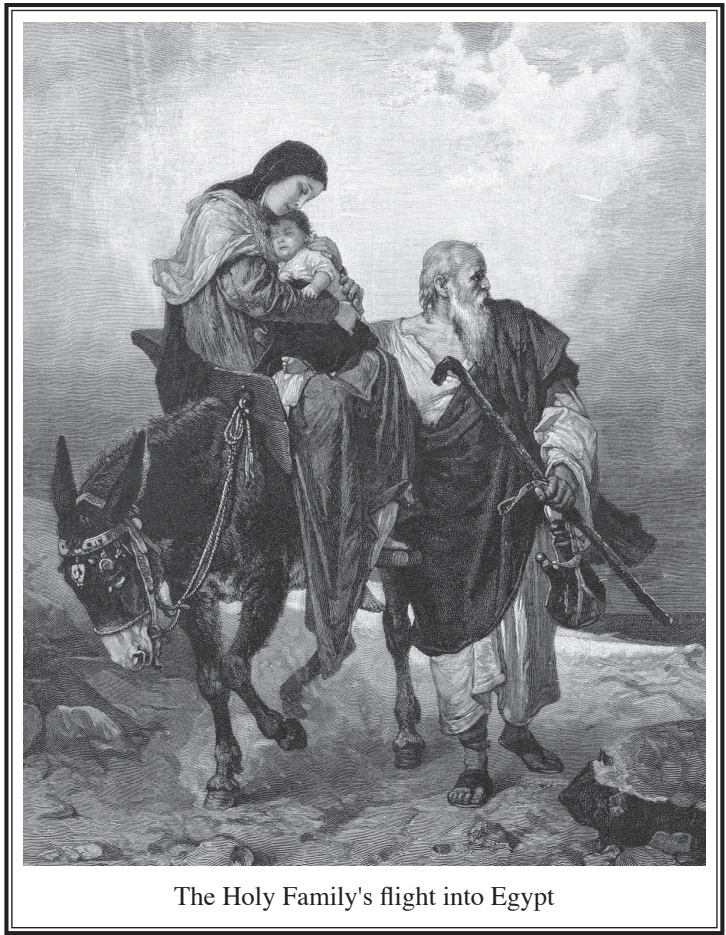
The Holy Family's flight into Egypt

Mailing Address (both parishes): 7732 E State Rd 4 Walkerton, IN 46574