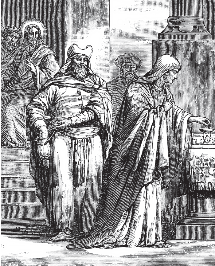
"She, from her poverty, has contributed all she had."

Mailing Address (both parishes): 7732 E State Rd 4 Walkerton, IN 46574