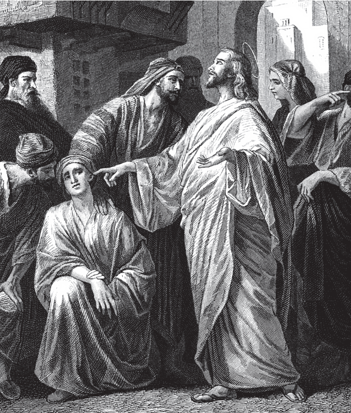
Jesus said, "Be opened!" – And immediately the man's ears were opened, his speech impediment was removed, and he spoke."

Mailing Address (both parishes): 7732 E State Rd 4 Walkerton, IN 46574