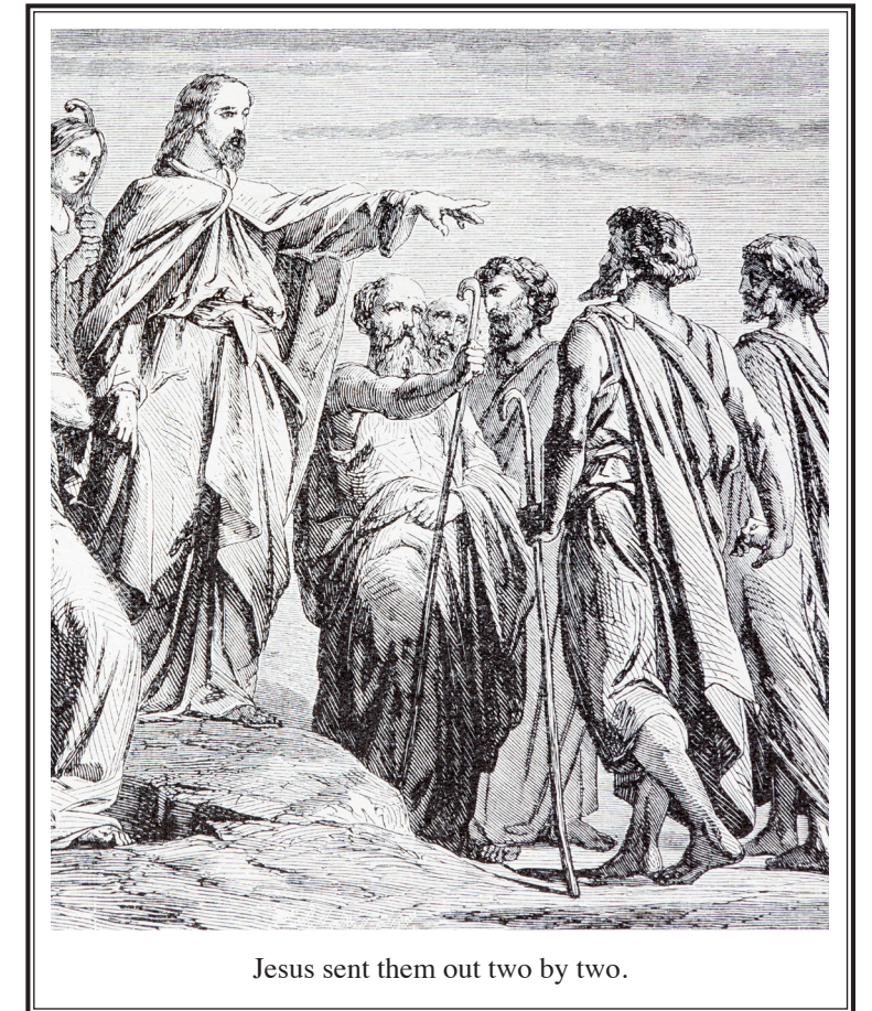
Jesus sent them out two by two.