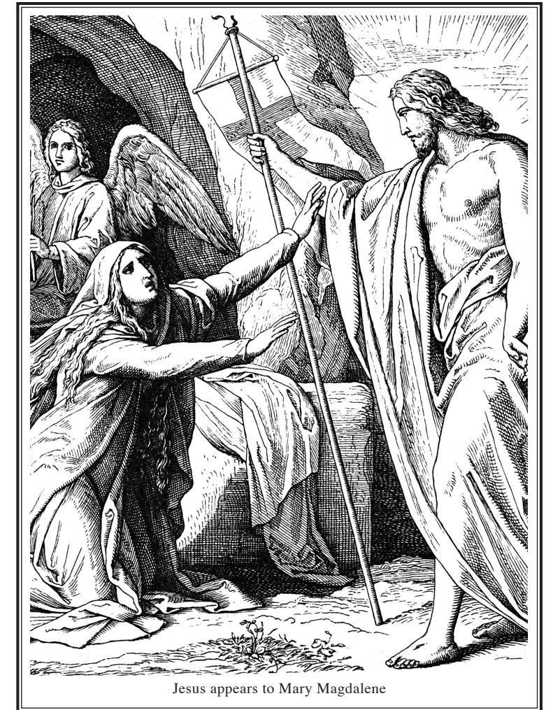
Jesus appears to Mary Magdalene

Mailing Address (both parishes): 7732 E State Rd 4 Walkerton, IN 46574