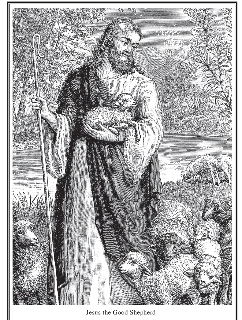
Jesus the Good Shepherd

Mailing Address (both parishes): 7732 E State Rd 4 Walkerton, IN 46574