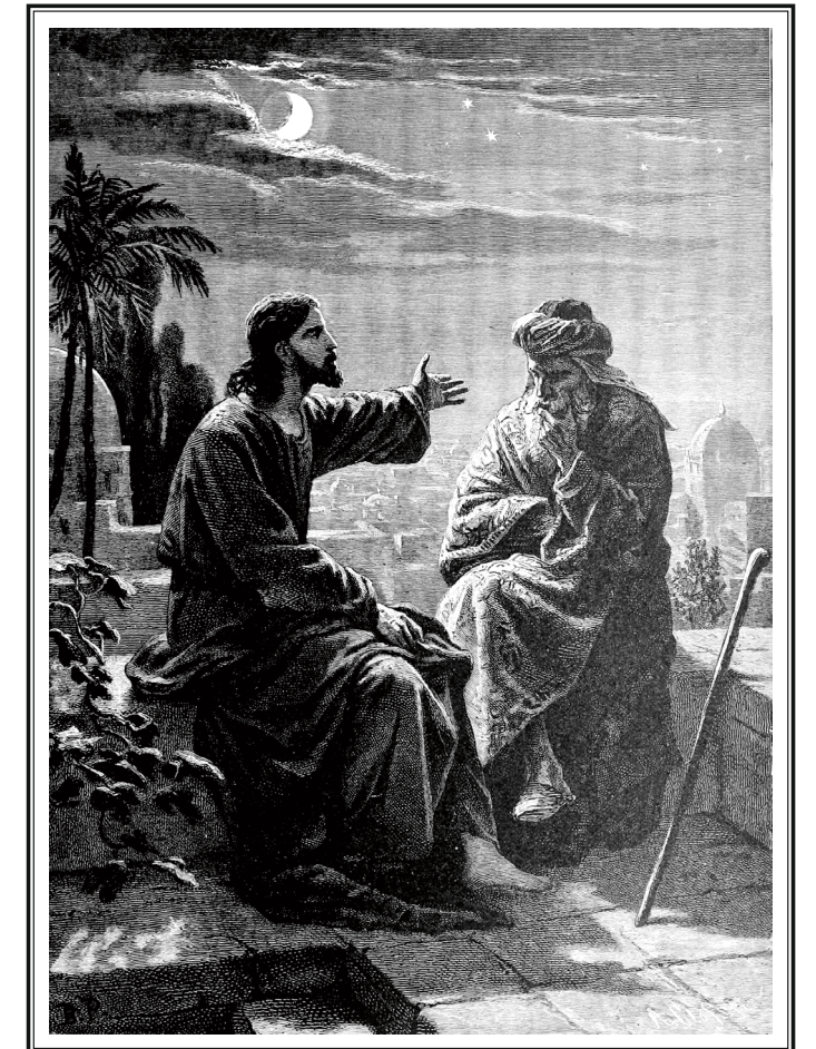
Jesus speaks with Nicodemus

Mailing Address (both parishes): 7732 E State Rd 4 Walkerton, IN 46574